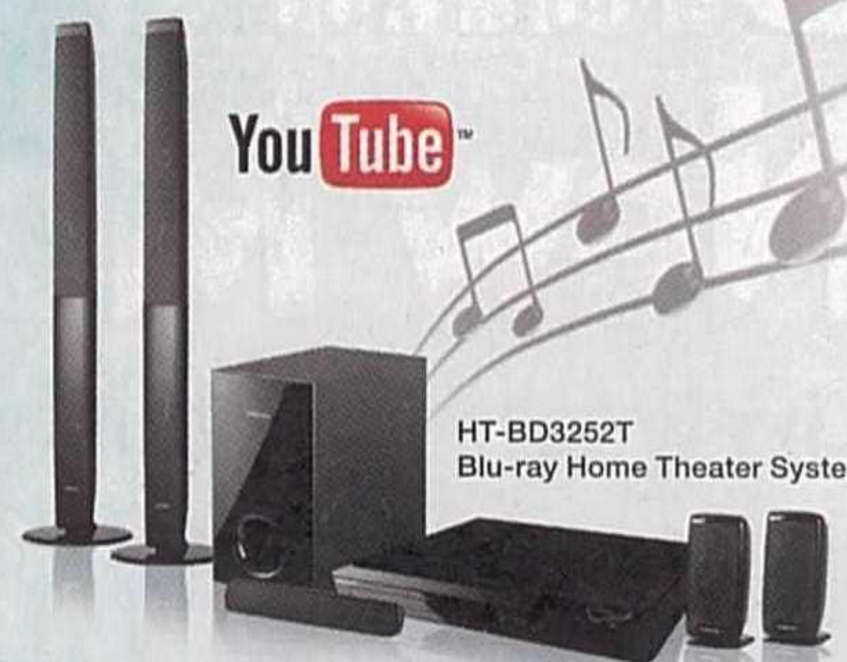
HT-BD3252T Blu-ray Home Theater System