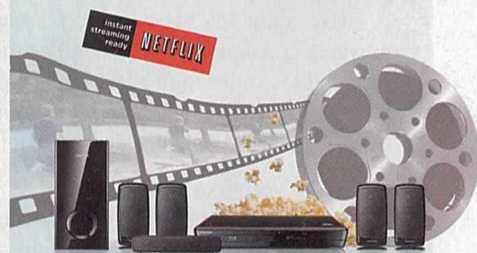
HT-BD1250T Blu-ray Home Theater System